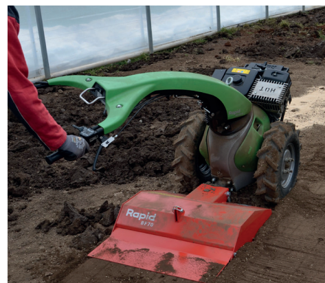
Laterally adjusted handlebar

The rotary tiller is operated with the handlebar turned, i.e. between the walk-behind tractor and the operator. For this reason, the balance is crucial in this application and has a decisive influence on the handling of the overall combination.