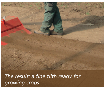
The result: a fine tilth ready for growing crops