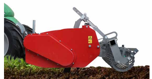
Quick lift working position