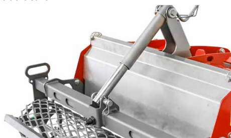
Optional manual spindle for height adjustment of the trailing roller

The working depth is set by adjusting the trailing roller. The optional manual spindle makes it really easy to adjust on a continuous scale.