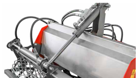
Optional hydraulic height and lateral adjustment of the trailing roller