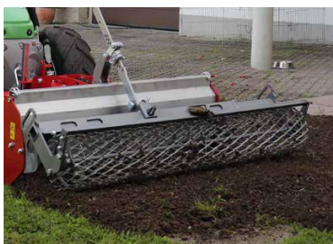
Work in unwanted grass in a single operation

The rake on the stone burier can be removed without tools, regardless of the baffle plate. This means that the stone burier can also be used as a pulled rotary tiller and allows a versatile use.