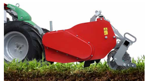
Quick lift transfer position

The rapid quick lift (RQL) and the click-in of the trailing roller ensure a uniquely simple implementation and an uninterrupted workflow. This revolutionises the workflow and makes tilling even more efficient. The RQL is intuitively activated by lifting and moving forward, allowing for a fluid workflow.